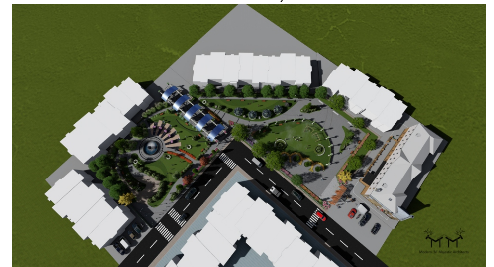
LANDSCAPE DESIGN (R.S. HOUSING SOCIETY)