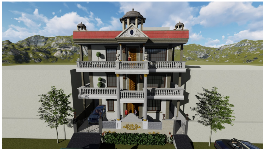
SHAKTAWAT HOUSE, UDAIPUR