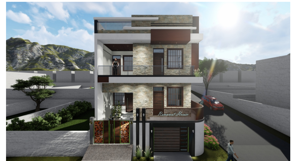
RANAWAT HOUSE, UDAIPUR