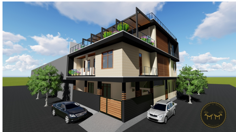
VIKRAM VILLA, UDAIPUR