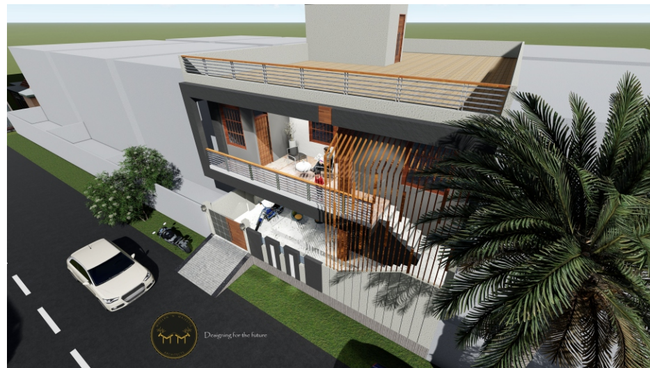
KUNCHOLI HOUSE, UDAIPUR